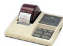
AD-8121 Statistical Printer